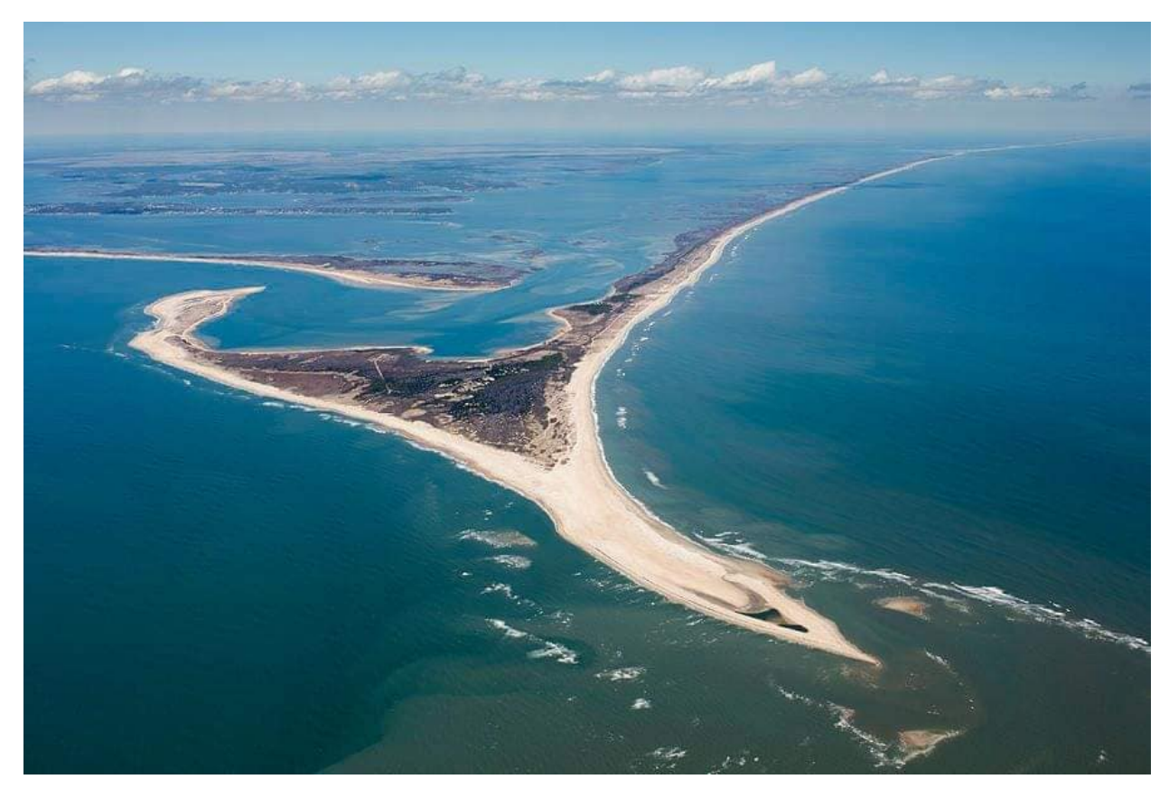
Ariel view of Cape Lookout

Cape Lookout is a wonderful offshore location although not that far from the mainland at Beaufort. The anchorage known as the Bight is behind the dunes directly west across the water from the diamond painted lighthouse. The Cape is located at the southern tip of the North to South Outer Banks. The land above the Cape in this photo is the Eastern tip of Schakleford Banks and above that Harkers Island.